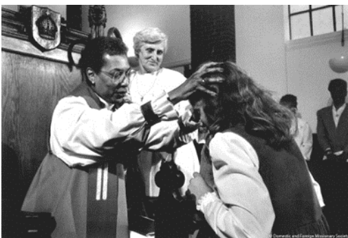
Bishop Barbara Harris confirms a member of the Church of St. Stephen in Boston, Massachusetts, 1990.

The Archives staff will be in the Exhibit Hall at the 81st General Convention in Louisville, Kentucky, June 21-27; all attendees are encouraged to stop by and receive a memento of the exhibit’s launch. The exhibit also includes link to current organizations, including the Episcopal Church Women , who will celebrate their 51st Triennial gathering June 22-28 in conjunction with General Convention.