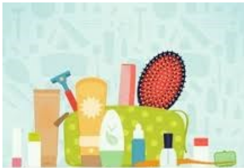
Essential toiletries kit

And if you are traveling this summer, please bring back any soaps, shampoos and lotions that you may find in your hotel room.