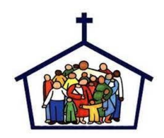
A Quick Note from the Stewardship Committee

If you are interested in knowing more about the Episcopal Church or want to explore confirmation or reception into the Episcopal Church this is the class for you.